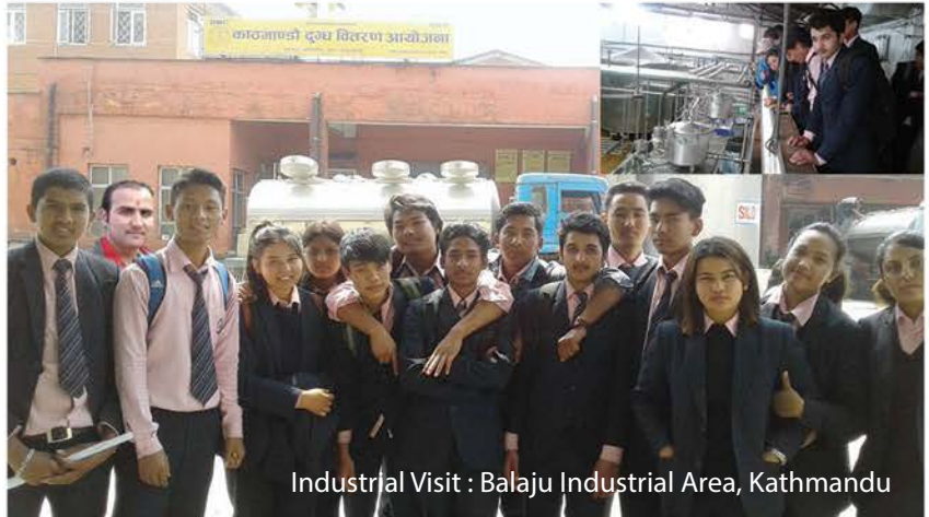
Industrial Visit : Balaju Industrial Area, Kathmandu