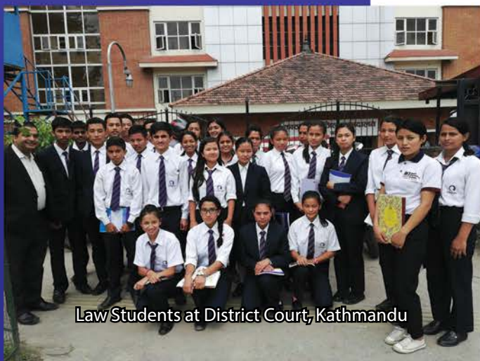
Law Students at District Court, Kathmandu