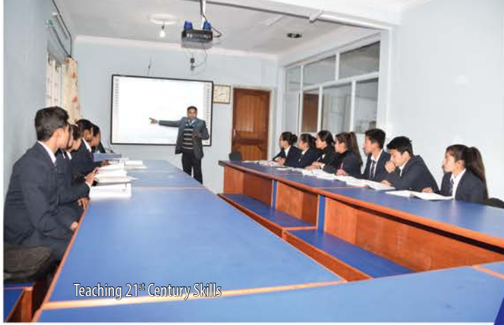
Teaching 21 st Century Skills