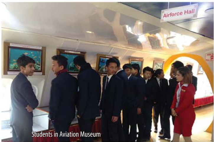
Students in Aviation Museum