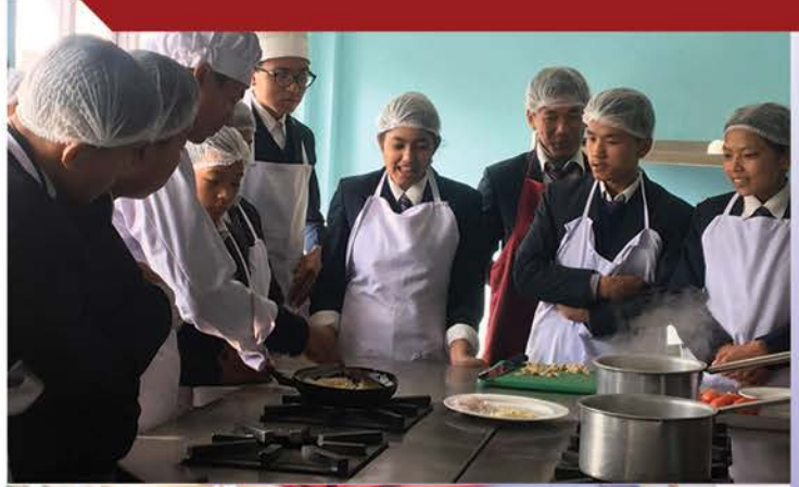
Hotel Management in Practice