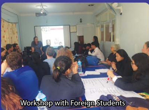
Workshop with Foreign Students