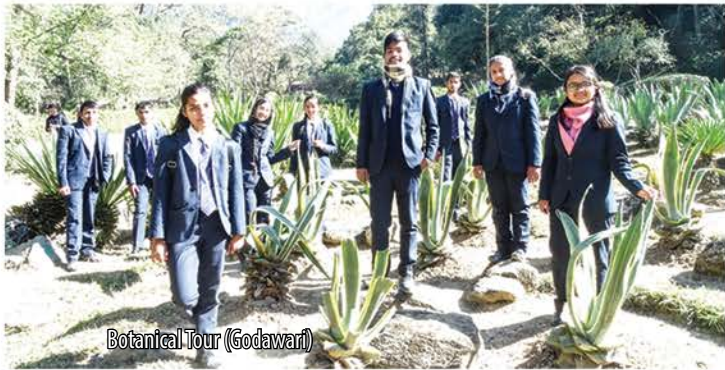
Botanical Tour (Godawari)