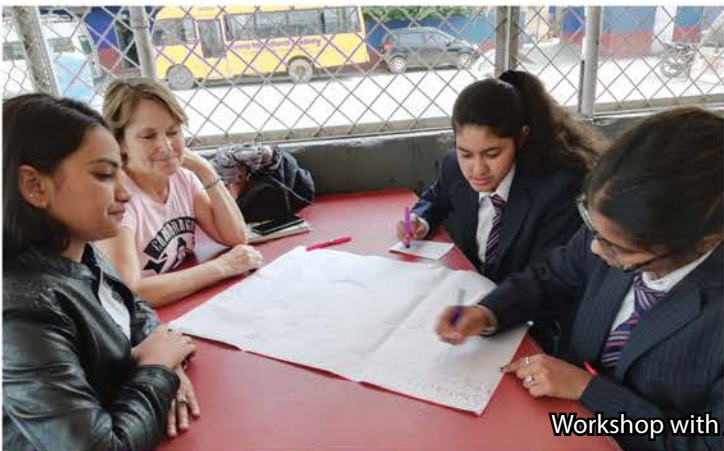
Workshop with Australian Students