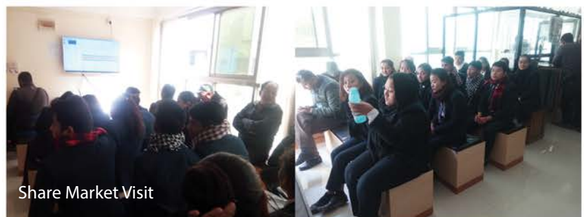
Share Market Visit