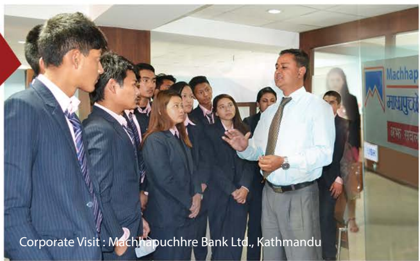
Corporate Visit : Machhapuchhre Bank Ltd., Kathmandu

Riviera focuses on the participation of the students in research-based project works, educational field trips and self-learning activities. They can develop intellectual skills of critical analysis and also valuable transferable skills.