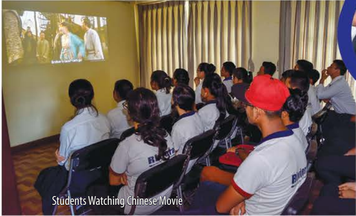
Students Watching Chinese Movie