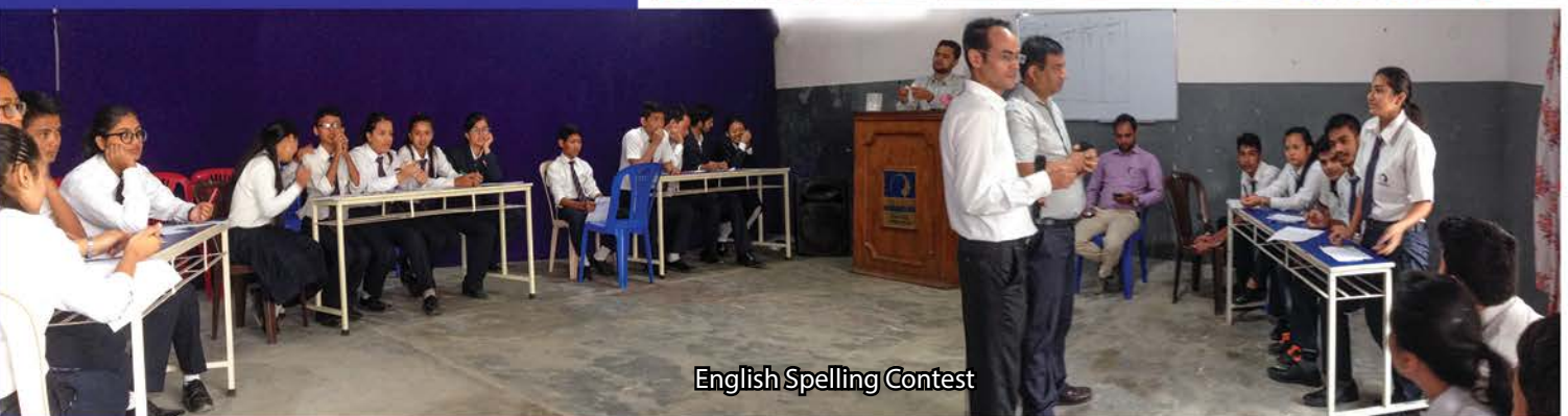
English Spelling Contest