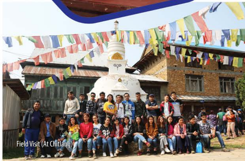
Field Visit (At Chitlang)