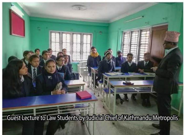
Guest Lecture to Law Students by Judicial Chief of Kathmandu Metropolis