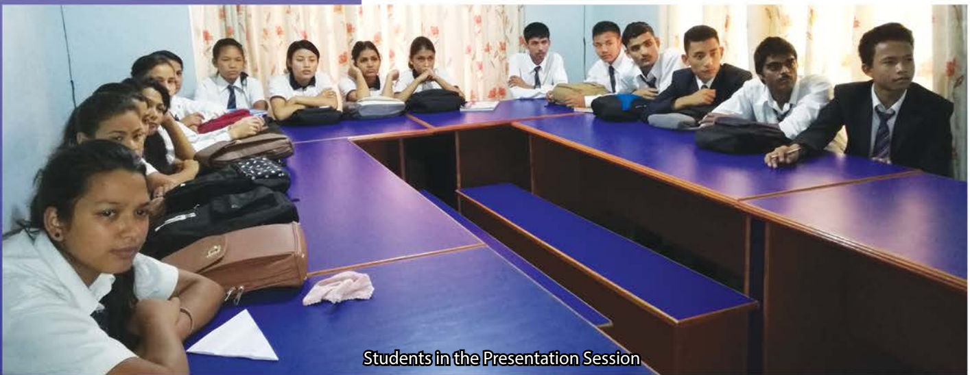
Students in the Presentation Session